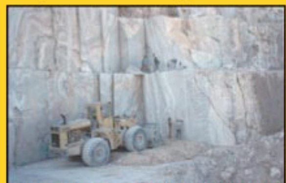
Mining, Marble and Granite Quarrying